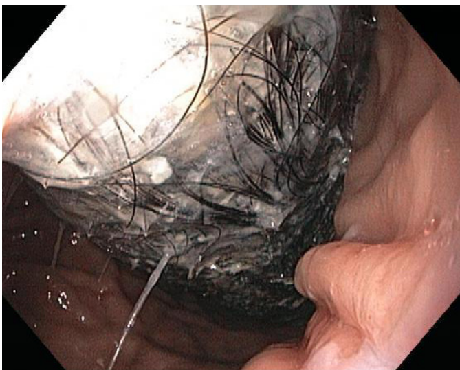
Figure 2. Endoscopic image of trichobezoar.

Upper endoscopy revealed hair in the oropharynx and esophagus, and a large trichobezoar filling the entire stomach that prevented passage of the endoscope beyond the proximal gastric body (Figure 2). Due to the size and nature of the trichobezoar, general surgery was consulted for surgical resection. The patient underwent laparotomy with gastrotomy and removal of the trichobezoar, which was described by the surgeons as a cast of the entire stomach made entirely of hair that extended partially into the duodenum. The specimen removed measured 23.0 x 6.0 x 5.0 cm (Figure 3).