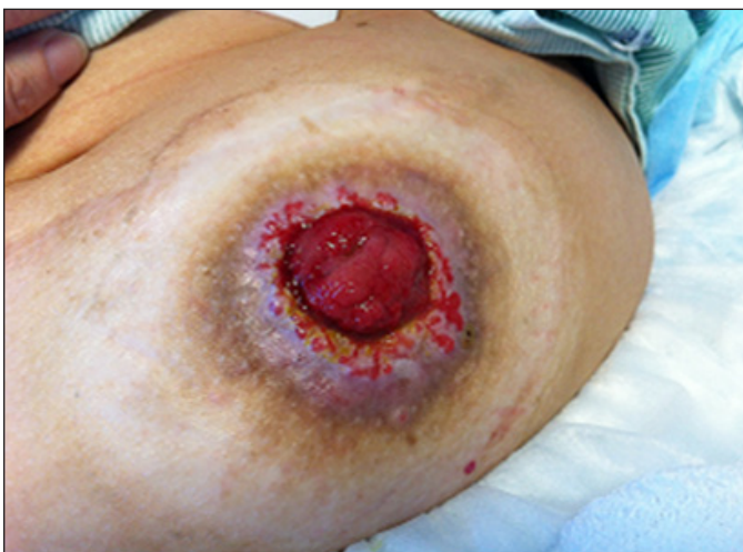
Figure 2. No visible bleeding sites in the protruded stoma or adjacent skin at bedside inspection.

Six months later, she presented with a recurrent episode of gross blood in her ostomy bag with drop in hemoglobin, but bloody stoma output stopped spontaneously after admission. Surgeons evaluated the patient, but stoma revision was not recommended due to the risk of short bowel and possible recurrence of the parastomal hernia. She was discharged home with conservative management. Three months later, she presented again with gross blood in her ostomy bag with drop in