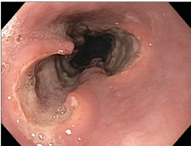
Figure 1. An idiopathic esophageal ulcer of the distal esophagus prior to initiation of HAART.

The gastrointestinal tract—particularly the esophagus—can have disease involvement in up to 40% of AIDS patients not on HAART. 1 Herpes simplex virus typically causes shallow ulcers, whereas cytomegalovirus (CMV) often affects the distal esophagus with very large and deep ulcers. CMV ulcers and IEUs often have a similar appearance endoscopically, and require multiple biopsies to differentiate. Kaposi sarcoma is the most common esophageal neoplasm with typical-appearing bulky purple-tinged mucosa with submucosal nodular lesions. 1 The diagnosis of IEU is one of exclusion after endoscopy with multiple biopsies. The pathogenesis of IEU formation is hypothesized to be from T-cell activation and subsequent apoptosis of the esophageal mucosa. 2