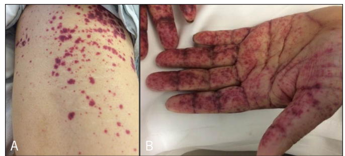
Figure 2. Palpable, purpuric rash on the patient's (A) right thigh and torso and (B) hand.

The skin rash spread from her hands in a centripetal manner to involve the chest and thorax during the first day of her hospitalization (Figure 2). Skin biopsy revealed perivascular neutrophil infiltration of the upper dermis with neutrophilic degeneration, fibrin exudation, destruction of the vascular wall, and intravascular thrombi, consistent with leukocytoclastic vasculitis. A kidney biopsy was also performed and demonstrated proliferative glomerulonephritis and advanced interstitial fibrosis and tubular injury, with IgA and C3 deposition. Serum rheumatoid factor was negative. IgA was elevated at 633 mg/dL (normal: 85–385 mg/dL) and IgM was reduced at 24 mg/dL (normal: 45–250 mg/dL), while IgG was normal. C4 was normal and C3 was reduced at 67.5 mg/dL (normal: 70–176 mg/dL). Based on these findings and both gastrointestinal and renal involvement, the patient was diagnosed with Henoch-Schönlein purpura (HSP). Treatment with intravenous methylprednisolone was initiated. Her rash rapidly improved; however, she did require hemodialysis for oliguric renal failure. The AEN was managed conservatively with proton pump inhibitors. She required parenteral nutrition until her oral intake improved. A repeat endoscopy 9 days later revealed a diffuse and circumferential, pale yellow fibrinous layer in the esophagus and slightly improved ischemic duodenitis in the second portion of the duodenum (Figure 3).