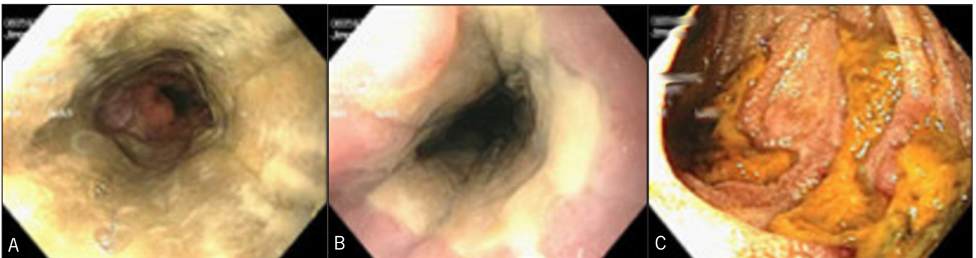
Figure 3. Repeat upper endoscopy 9 days after presentation showing improvement in the (A) upper third of esophagus, (B) lower third of esophagus, and (C) second portion of duodenum.

The overall incidence of AEN is very low, between 0.01 and 0.28%. 3 AEN characteristically involves the distal esophagus with variable extension proximally. The etiology likely involves tissue hypoperfusion, corrosive gastric reflux, diminished immune defenses, or infection. 1,2,4 Based on prior case series, the most common presentation is upper gastrointestinal bleeding. 2,4 Risk factors for developing AEN include cardiovascular disease, diabetes mellitus, chronic kidney disease, and cancer. 1,2,4 Complications of AEN include esophageal stricture formation and rare esophageal perforation. The overall mortality is high and exceeds 30%. 2,4 It has